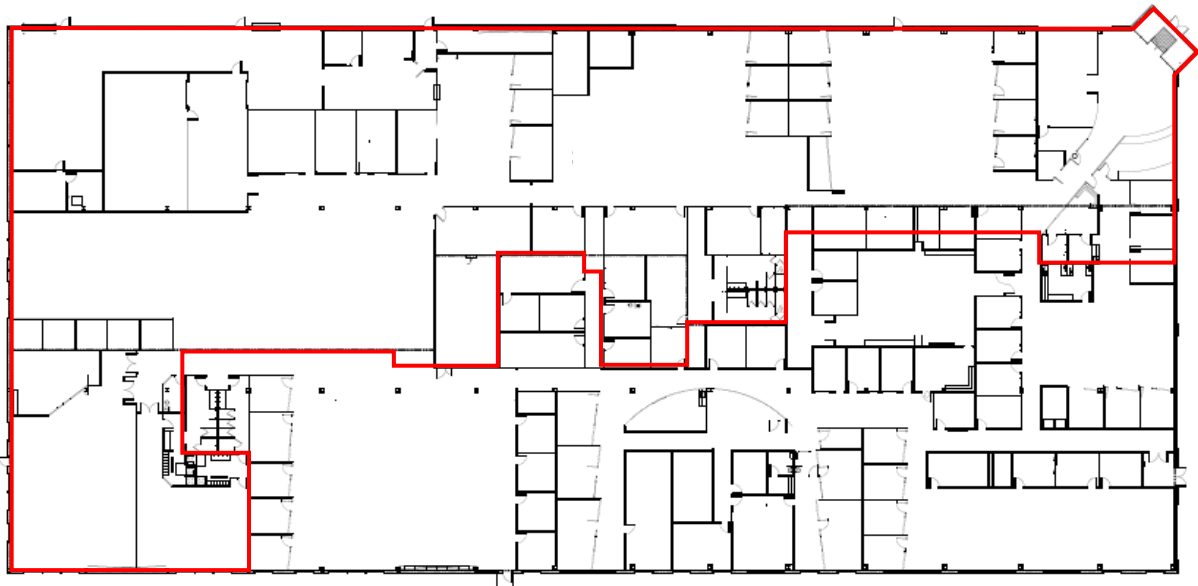
Existing Floor Plan Approximate Outline of Available Space